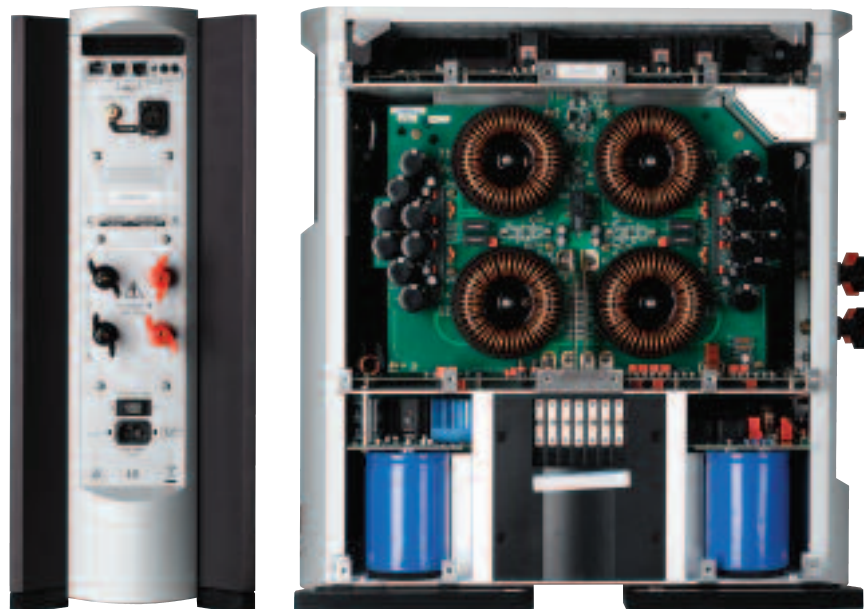
This side view shows the four different compartments of the amplifier: the power supply section at the bottom, the middle section with the four amplifiers, the top section with the control circuitry (modulator), and a separate enclosed box (top left) that houses the analog input board.